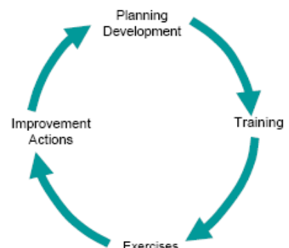
Figure 3.1 One-year Cycle

The jurisdictions within the State of Alaska take a holistic, cyclical approach to training and exercise development because training and exercises should not exist in a vacuum. The intent is to integrate them into an overall preparedness program. Therefore, the program follows the cycle of planning/development, training/preparation, exercises, and corrective action / improvement.